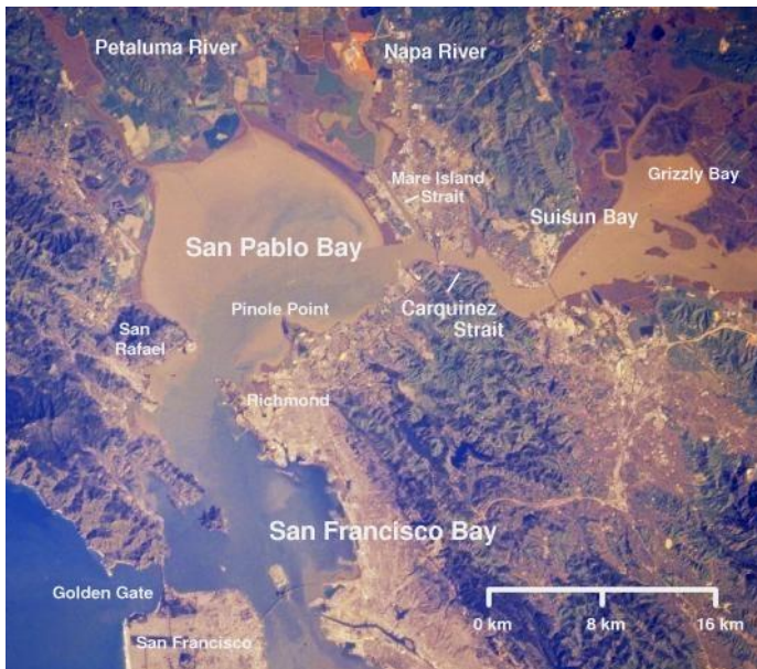
San Francisco Bay today